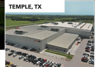
FILL, FORM, FINISH, AND DISTRIBUTION FACILITY

Operating the largest, single-site battery manufacturing facility in the world with on-site battery recycling in Lyon Station, PA, and distribution facilities across the country.