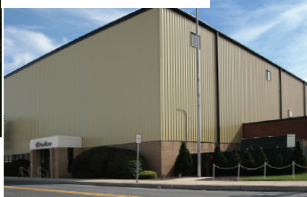
WIRE, CABLE, AND BATTERY ACCESSORY PRODUCTS FACILITY