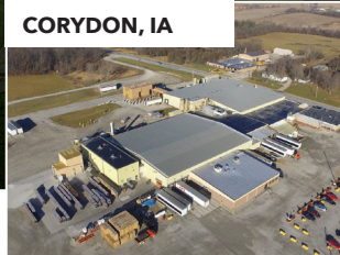
BATTERY PRODUCTION FACILITY