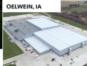
FILL, FORM, FINISH, AND DISTRIBUTION FACILITY